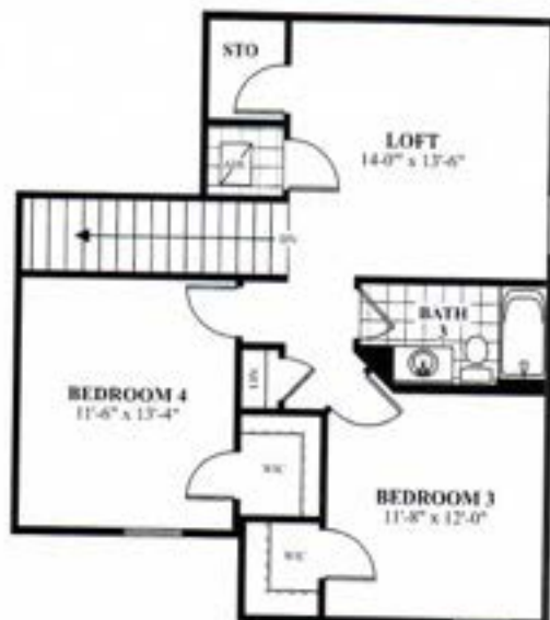
SECOND FLOOR 9'-4" CEILING HGT. UNLESS OTHERWISE NOTED